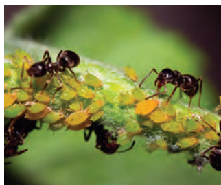
Ants are attracted to the honeydew that aphids make.

Aphids (and other plant pests including whiteflies and scale) produce a sweet, sticky substance called honeydew that attracts ants. Seeing a lot of ants on plant stems is a sure sign of a pest infestation. Since ants will actually protect honeydew-producers from natural predators, it's important to keep ants away when you're trying to get rid of aphids.