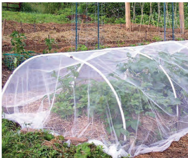
A row cover will keep aphids away from plants.