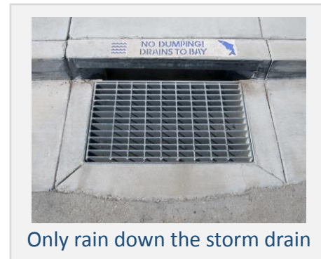
Only rain down the storm drain