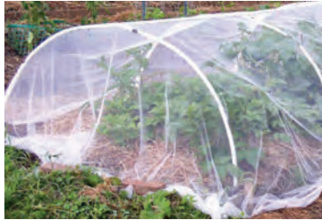
Row covers keep snails out.