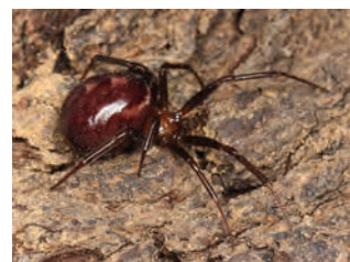
False black widow