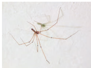
Longbodied cellar spider