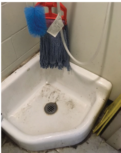
Sanitary sewer drain flows to treatment plant.