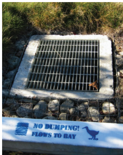
Only rain should flow down the storm drain. Storm drains flow directly to creeks and the Bay.

This booklet will provide instruction on when to contact your local water treatment plant for information about what can and cannot go to the sanitary sewer.